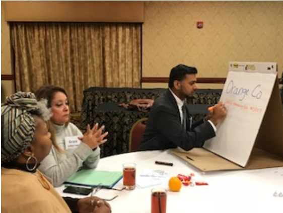
Attendees from Orange County brainstorm during the regional discussion group session

At the end of the day, attendees broke into small groups, organized by region, to reflect and process Summit content, and identify key points for legislative meetings the following day. Discussions were facilitated by regional leaders, and focused on current issues that could impact health care for CYSHCN.