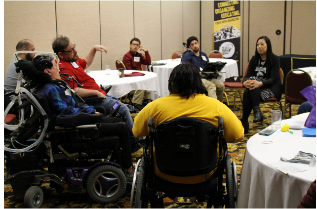
Youth Track participants