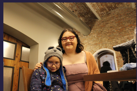
Self advocates share their stories.